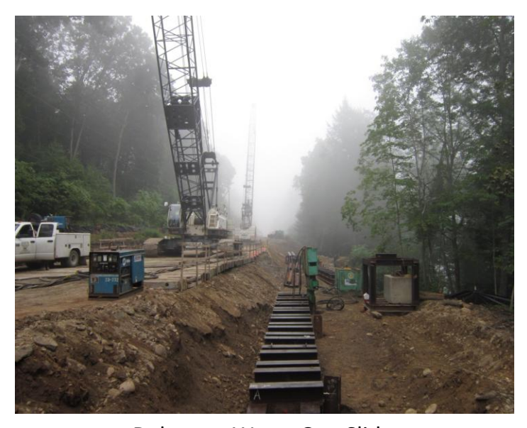
Delaware Water Gap Slide

The area around Stroudsburg, Pennsylvania is known as an area of great beauty, with towering cliffs overlooking deep river and stream valleys. Part of the scenery found there is due to past glaciations, which can be susceptible to landsliding. Two sites will be discussed during this talk, one located in the Delaware Water Gap Recreation Area (Route 209 Slide), and one to the south of Stroudsburg along Cherry Valley (S.R. 2006). The sites are similar in that they are located in glacial sediments on the side of retreating glaciers, and both are being eroded at the toe by meandering water courses. Extreme weather events were involved in both events and the underlying bedrock geology is believed to have contributed to the development of the slides. The similarities and differences in the two slides are discussed, as well as complications involved in the proposed repairs.