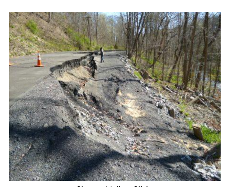
Cherry Valley Slide