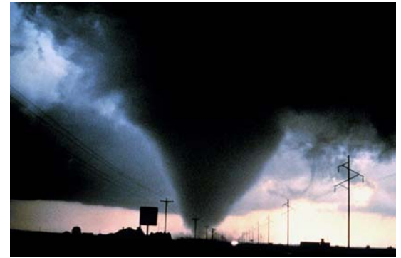
A Tornado near Dimmit, Texas in 1995.

A tornado is a violently rotating column of air extending from a thunderstorm to the ground. In an average year, about 1,000 tornadoes are reported across the United States, resulting in 80 deaths and over 1,500 injuries, according to the National Oceanic and Atmospheric Administration. The most violent tornadoes are capable of tremendous destruction, with damage paths as wide as a mile and as long as 50 miles and wind speeds of 250 mph or more. Destruction of homes, crops, and utility infrastructure cost the U.S. hundreds of millions of dollars every year.