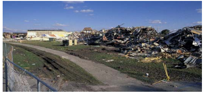
Tornado damage in Kissimmee, FL.